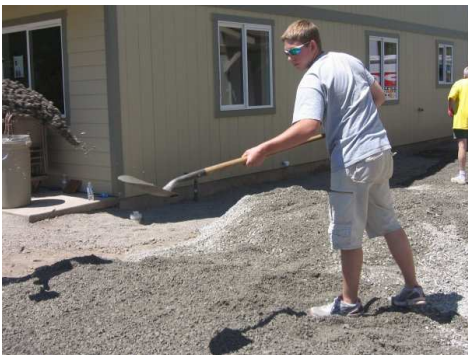
Trinity Friends in Faith